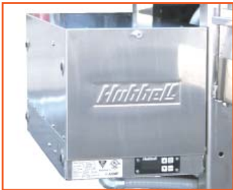
(AVAILABLE WITH) STAINLESS STEEL BUILT-ON BOOSTER.