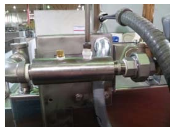
Mixing chamber with two 1/8" pipe threaded ports Hi-temp mixing chamber is SS, Chemical is a polymer