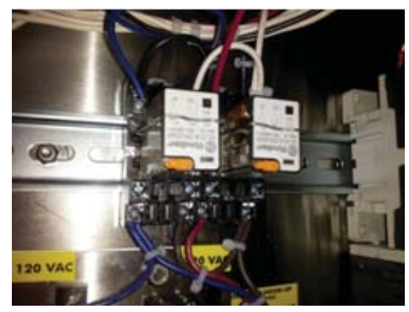
Conveyor motor control relays