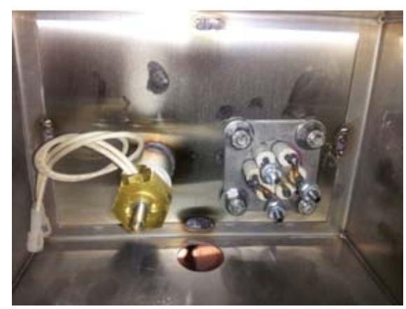
Wash tank thermostat, rotate center rod Left to increase

TANK TEMPERATURE—The wash and pumped rinse tank temperatures are maintained by sustainer heaters. Record tank temperatures during the initial tests. There are three (3) gauges mounted under the control box. Gauges are marked Wash/Rinse/Final Rinse. Wash tank temperature should be 140°F for chemical sanitizing and 150°F for hot water sanitizing in multi-tank conveyors. The pumped rinse tank temperature should be 120°F for chemical and 160°F for hot water sanitizing. If tank temperatures are low, increase by adjusting the heater thermostats located behind the front panels.