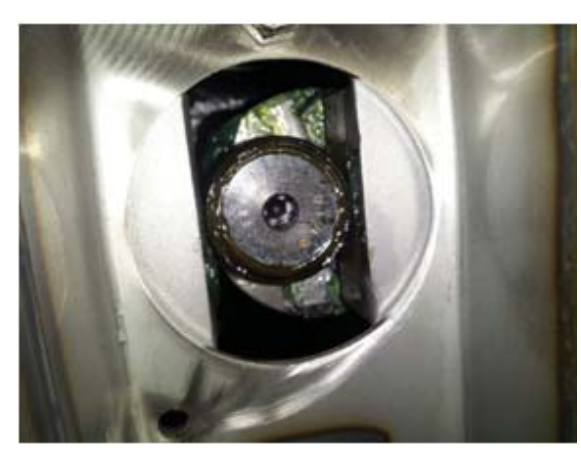
Cam bearing screws into cam block B