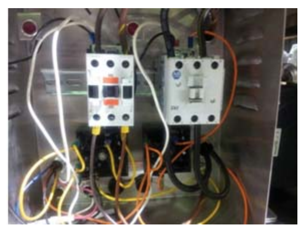
T-stat signal goes to term #6 on heater relay under contactor

THERMOSTATS—There are two thermostats, one for each tank. Increase temp by turning center rod of the thermostat counter clock-wise or turn to the left. Adjust thermostats in small increments (1/4 turn). Heaters are switched off when water levels are low and the fill has been activated. Final rinse temperatures are 120°F for chemical sanitizers, and 180°F for hot water sanitizing supplied by a booster. To increase the final rinse temperatures turn up the thermostat on the booster heater or water heater for 120°F. Do not set a booster heater above 195°F.