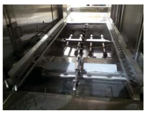
Travel through conveyor tray rails, center pull bar w/dogs

FLOAT" AND SWITCH—the float will not actually float. It is heavier than water but it weighs less in water than in air. This difference allows the return spring in the float switch to push out against the lever, which raises the float in the water. In air the float's weight will overcome the switch's spring tension and drop down. The float switch (#291-3014) is specifically made with this spring tension so the water control system will operate correctly. Do not replace with a timer switch even though they look similar.