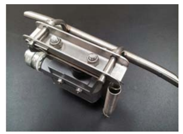
ADS table limit, and table bumper bar (#288-1044)

TABLE LIMIT SWITCH—Check clean dish table, if it holds less than four (4) dish racks, install an ADS table limit switch (#288-1044). The switch holder attaches to the back side of the table end. The bumper bar will extend through the table and pin to the rocker plate. When racks strike the bar, the switch will break the power connection in the machine's door cut-off switch, which stops all motors.