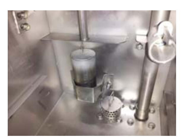
Rinse tank float, pump filter, pumped rinse manifold

FILLING THE MACHINE— When the machine is first turned on, water will automatically fill to an initial working level. During operation the water level will normally increase with each rack until water begins to exit the overflow into the scrap box. Open the access door and verify that the filling water is adjusted so the wash tank fills first and rinse tank fills last. The last tank to fill should be the pumped rinse tank. If the fill sequence does not follow this order, adjust the diverter plate inside the hood, it is located upward near the water inlet (see photo above). Slotted holes allow the diverter plate to move side to side adjusting the flow to the rinse tank. The water stream going into the pumped rinse tank should be about the <u>diameter of a pencil</u>. It is normal for the machine to add more water when the pump turns on if the level has not yet reached the overflow.