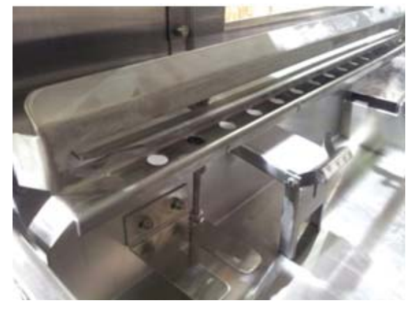
Wash tank sequence bar, pendulum with magnet