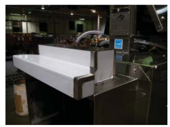
Vent attachments to end shield, 4" x 16" opening

INSTALL CURTAINS— There are two short and two long curtains. Longer curtains are mounted at each end of the dishmachine. Curtains are there to keep heat in the water.