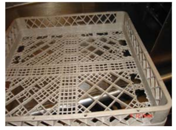
Damaged and broken rack that will jam or skip conveyor

TEST DISH RACK CONVEYOR MOVEMENT by placing a rack into the soil side opening until it catches on a conveyor dog. The rack should enter and exit smoothly without jamming. The dishmachine tray track will not adjust up or down, it is fixed. Tables must sit on the tank lip. Verify that tables are bolted to the machine, and once bolted, sealed with silicone caulking at all four corners and under the lip. Check that all varieties and brands of dishrack can fit between the dishmachine's tray track rails without binding. If binding occurs, adjust the REAR tray track at all (3) anchor points until the rack binding is eliminated. You must adjust evenly at all three points to maintain proper alignment. Never adjust the front tray track, they contain switching alignments.