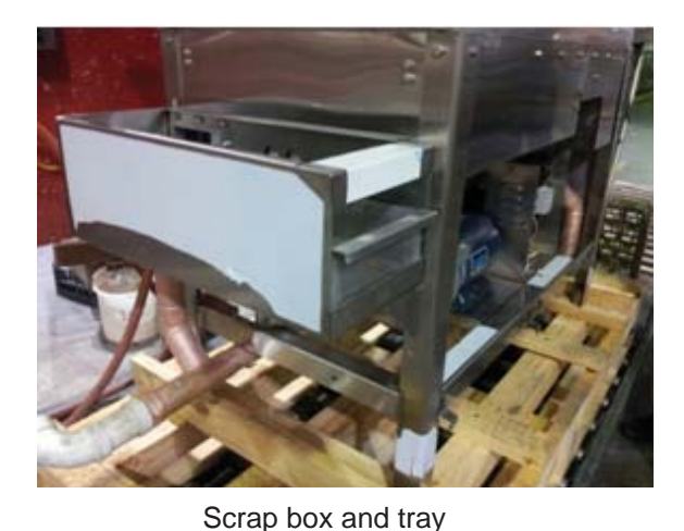
Showing 2" drain manifold exiting sump & scrap box

ADS provides a 2" copper common drain that exits on the soil side of the dishmachine under the scrap box. To prevent clogging, run drain lines as straight as possible. Do not plumb with tight radius elbows or 180° bends. Use of floor sinks for drains can cause flooding. Do not use reducing adapters for drain lines, always use 2" diameter pipe or larger. Always run gravity drain lines downhill.