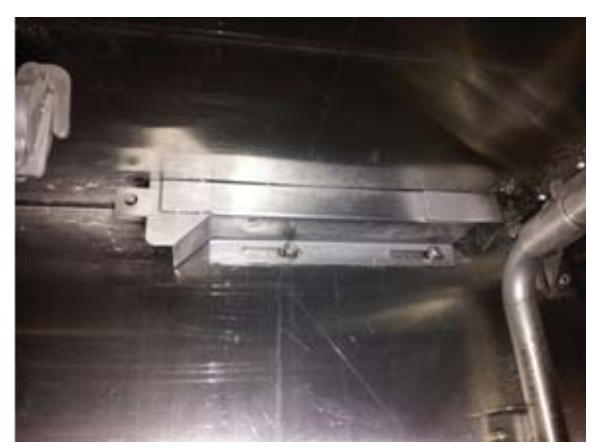
Diverter plate separates fill stream for wash and rinse tank

FILLING THE MACHINE— When the machine is first turned on, water will automatically fill to an initial working level. During operation the water level will normally increase with each rack until water begins to exit the overflow into the scrap box. Open the access door and verify that the filling water is adjusted so the wash tank fills first and rinse tank fills last. The last tank to fill should be the pumped rinse tank. If the fill sequence does not follow this order, adjust the diverter plate inside the hood, it is located upward near the water inlet (see photo above). Slotted holes allow the diverter plate to move side to side adjusting the flow to the rinse tank. The water stream going into the pumped rinse tank should be about the <u>diameter of a pencil</u>. It is normal for the machine to add more water when the pump turns on if the level has not yet reached the overflow.