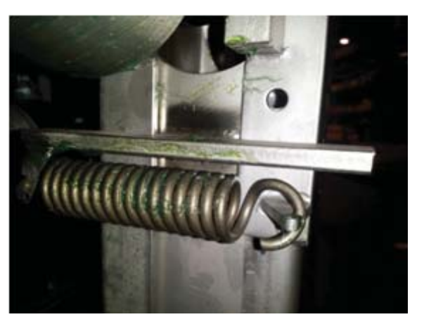
Rocker arm slip clutch spring, hook to bar weldment