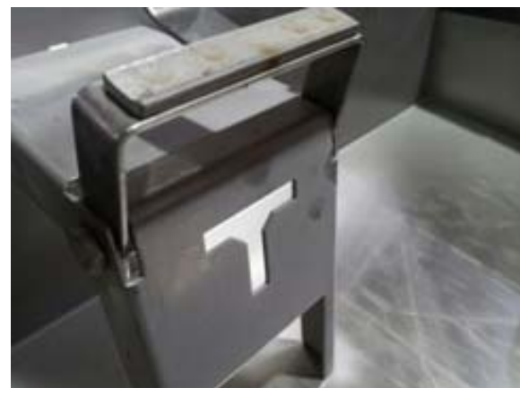
Showing wash arm T index for lower arm

Open doors and remove all packaging, including cardboard supports under the wash tank heater. Do not dispose of packing material until you remove spray arms and curtains. Packing materials contain the conveyor installation manual, QC check sheets, curtains; upper and lower wash arms, and pumped rinse arms.