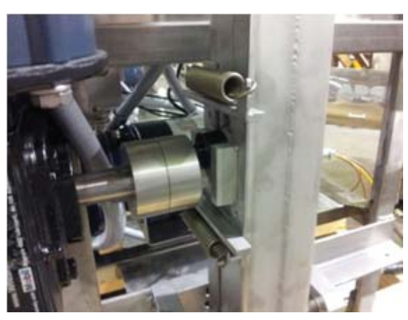
Conveyor cam blocks A & B

TEST DISH RACK CONVEYOR MOVEMENT by placing a rack into the soil side opening until it catches on a conveyor dog. The rack should enter and exit smoothly without jamming. The dishmachine tray track will not adjust up or down, it is fixed. Tables must sit on the tank lip. Verify that tables are bolted to the machine, and once bolted, sealed with silicone caulking at all four corners and under the lip. Check that all varieties and brands of dishrack can fit between the dishmachine's tray track rails without binding. If binding occurs, adjust the REAR tray track at all (3) anchor points until the rack binding is eliminated. You must adjust evenly at all three points to maintain proper alignment. Never adjust the front tray track, they contain switching alignments.