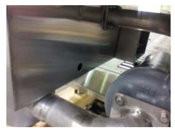
Showing 7/8" detergent probe hole behind pump motor

ADS provides two (2) ports, 1/8" IPS female threads in the final rinse mixing chamber for dispenser check valves. Probe hole (7/8") is provided in the wash tank for probe installations (install probe before operating the machine). Detergent hole (7/8") is provided for bulk-head fitting (install fitting before operating machine).