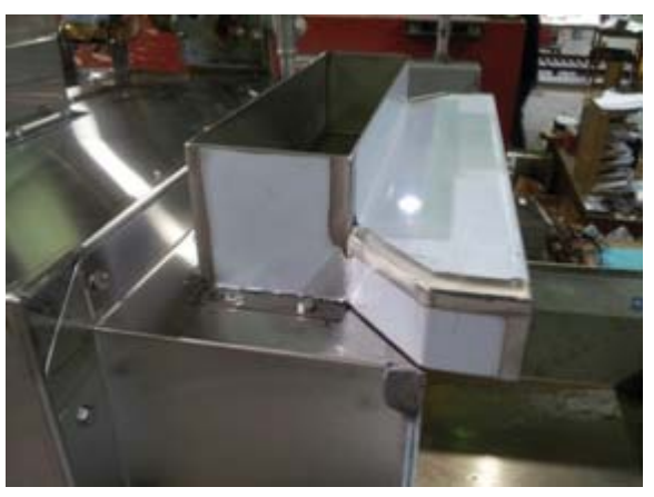
200 to 400 CFM draw per side