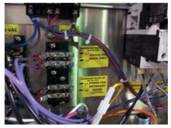
Dispenser signal connection terminals in control box

NOTE: Before turning on the water, if the chemical dispenser has not been installed, plug the probe and chemical delivery holes in the wash tank and plug the mixing chamber injection ports.