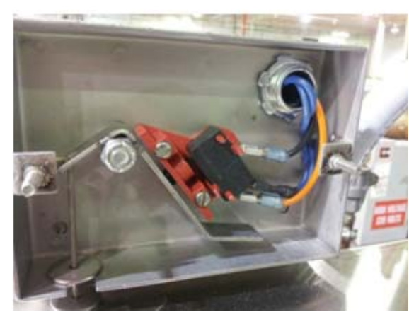
Showing "float" switch that controls fill water & heater

To operate, turn on the breaker for main power and turn the dishmachine master switch to the "ON" position.