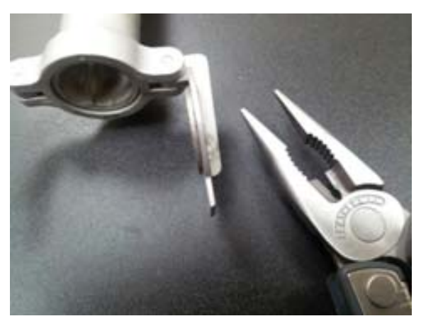
Straighten tab in line with the coin edge to tighten