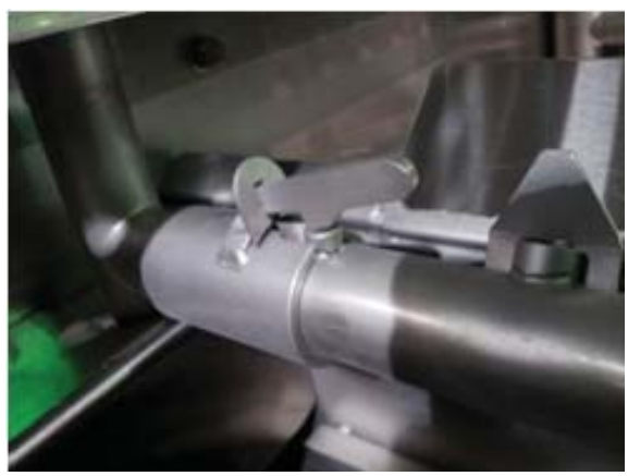
Rinse arm index notch, latch will drop as arm is pushed in