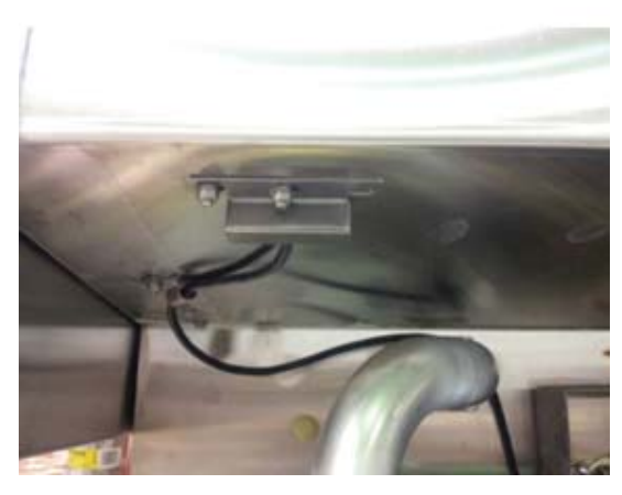
Sequence reed switch for wash tank

FINAL RINSE SECTION – The last sequence bar will control the final rinse and pumped rinse. The pumped rinse, which is called the water curtain, should begin when a dishrack contacts the bar. This is a low pressure spray and the lower spray should only rise 4-6" from the arm. After a six second delay, the final rinse will begin to spray. All functions should stop when the dishrack exits the machine unless there is another rack still inside.