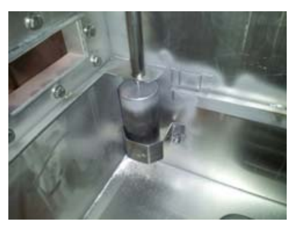
Wash tank float and tank overflow