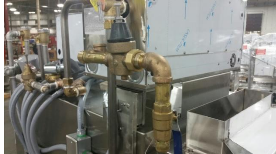
If PRV is required (only if 50psi or above) install here, not supplied