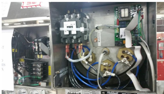
Typical electrical connection for booster power circuit inside front cover