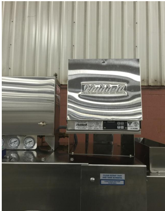
Front view of Right to Left conveyor, booster always on soil side