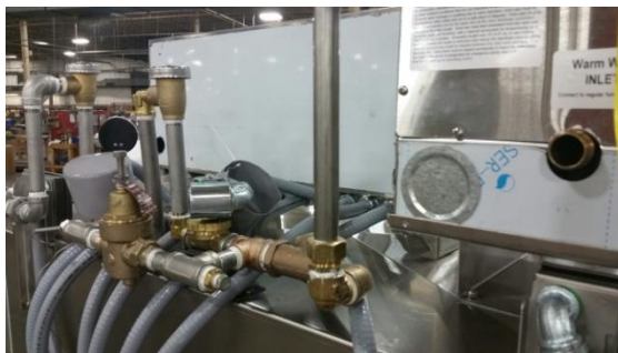
Water inlet \frac{3}{4} " at back of booster

The 208v, 27 kw is rated 74.9amps and minimum breaker is 95amps and 3 gauge wire. The 240v, 27 kw is rated 65 amps and minimum breaker is 85 amps and 4 gauge wire.