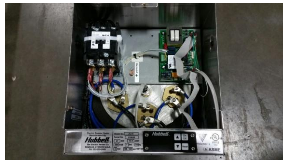
Individual power supply for booster, 95a, 208, 3-ph