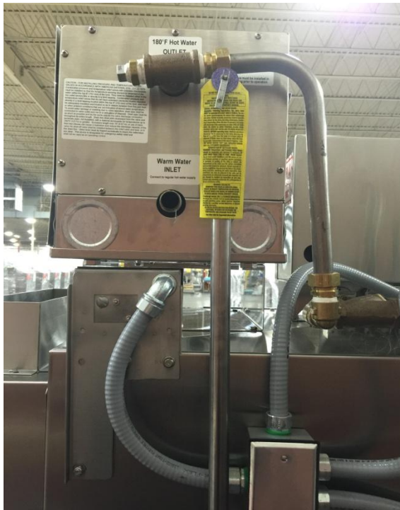
Inlet of the booster is 62.5" AFF, top of booster is 71" AFF