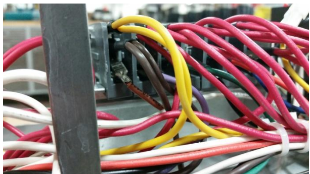
Wire connections made to the 7 th switch on cam timer