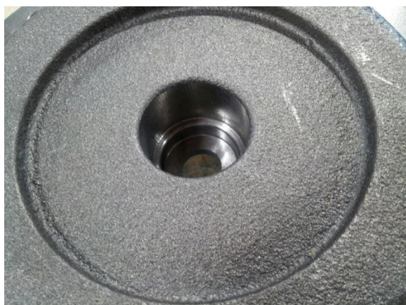
Use liquid soap to lubricate seal bore