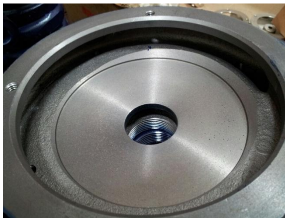
O-Ring gasket pump cover #082-6307 for open impellers