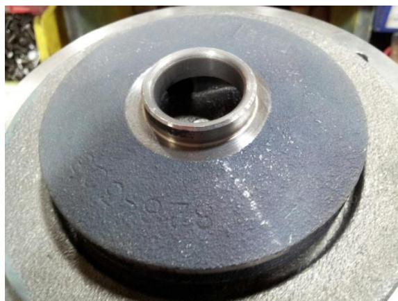
Screw on impeller by hand, rh threads