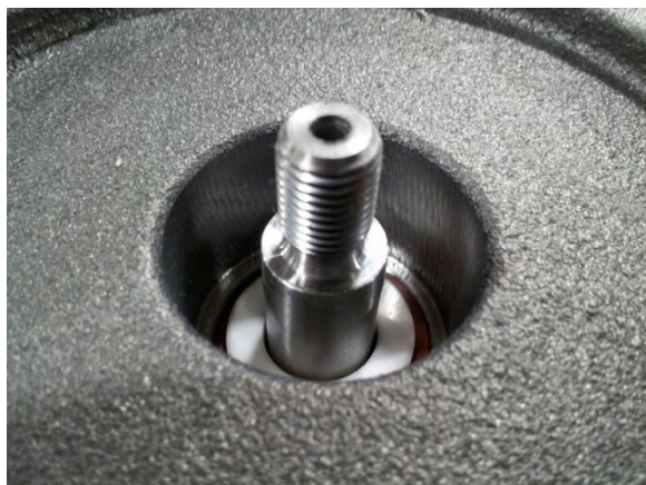
Install motor to housing, caution of ceramic