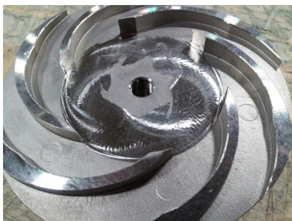
Open-Modified face #, (AF-ES, 5AGES)