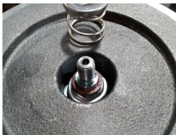
Press seal so 1/8" below the threads