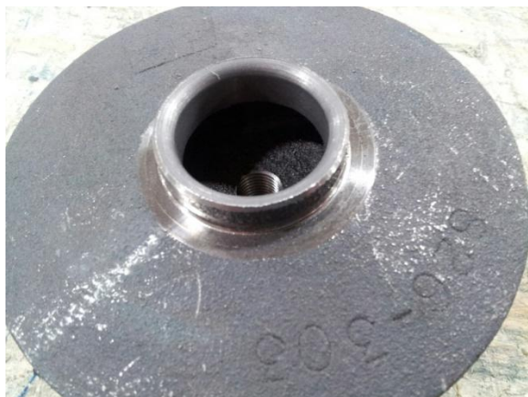
Standard closed face #082-6303(AF-3D-S, ET-AF, 5AG-S)