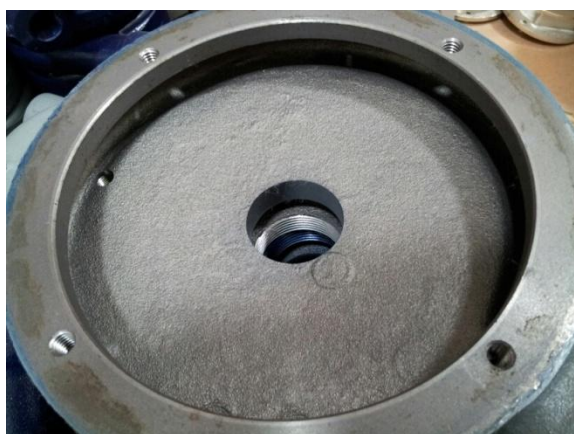
Standard, cork gasket, pump cover #082-6302 for closed impeller