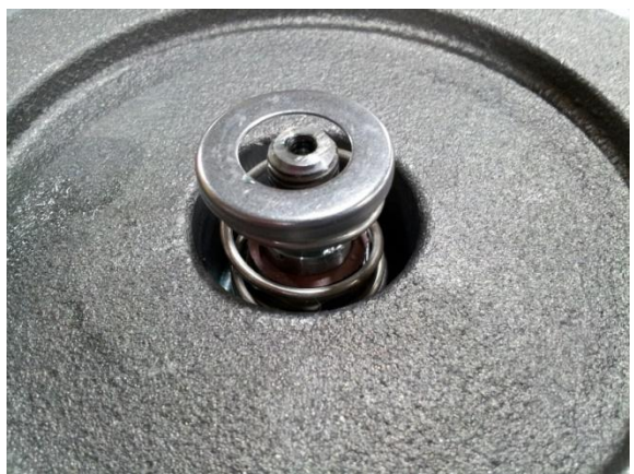
Place spring on w/spring cap toward impeller