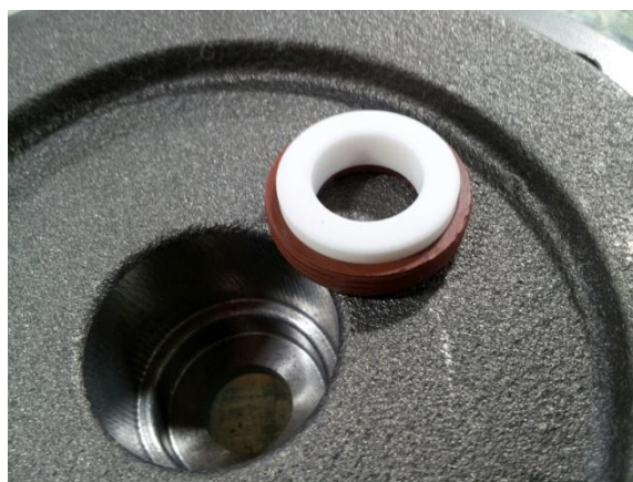
Ceramic, install with rubber boot on bottom