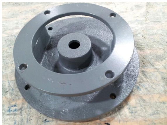
Showing the pump housing #082-6301, motor side