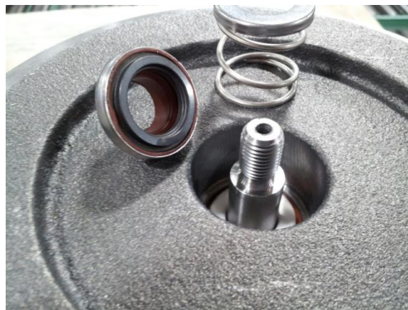
Black smooth face goes on motor shaft next