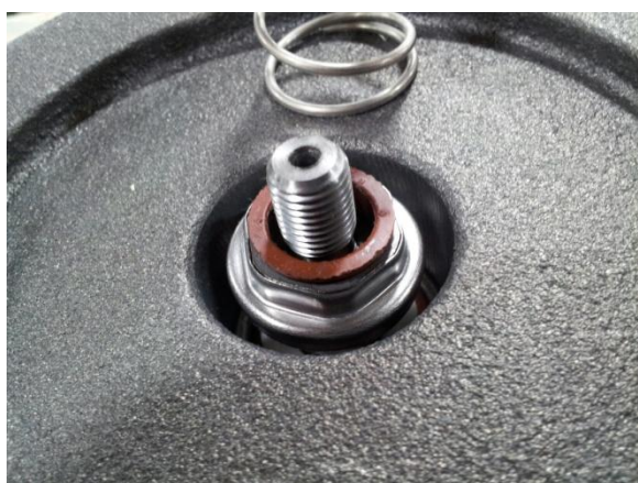
Press black portion of seal w/ installing tool