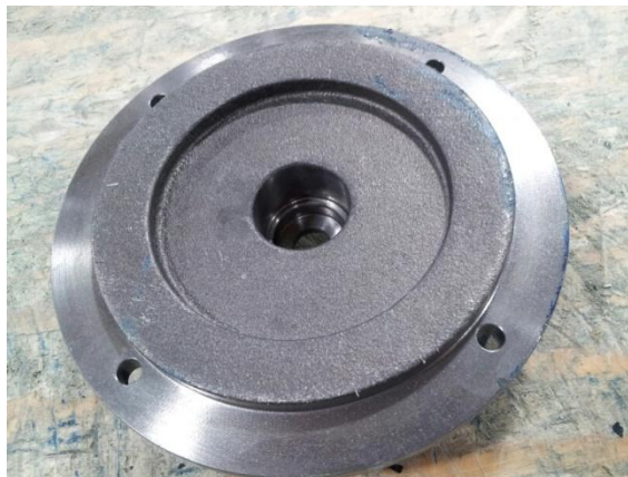
Pump housing, pump side