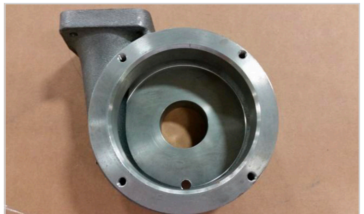
Open impeller (282-6303) 5 vane, 5.0" dia., deep profile, keyed shaft – w/ secure bolt w/lock strip (098-1613) washer (098-2711) Pump cover (282-6302), Rear housing (282-6301), Shaft Seal (292-2001), O-ring gasket (289-6603) Used on: ADC-44/66, HT25/34 for 3hp wash pump w/motor 291-1002