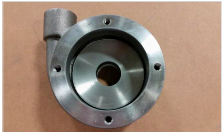
Open impeller (282-6308) 5 vane, 4.0" dia., low profile, screws on – right hand thread w/secure bolt (098-1443) washer (098-2413) Pump cover (282-6306), Rear housing (282-6307), Shaft Seal (292-2002), Fiber gasket (289-6609) Used on: ADC-44/66 for 1/3hp rinse pump w/motor 291-1003