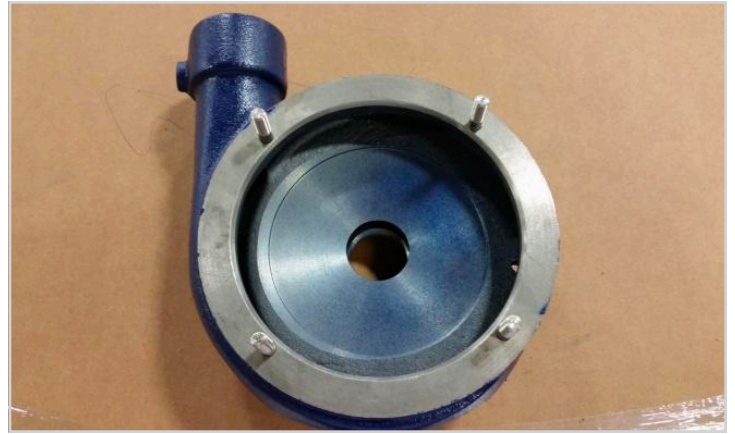
Open impeller (082-6312) 6 vanes modified, 5.0" dia., screws on – right hand thread Pump cover–stud mounted (082-6307), Rear housing (082-6301), Shaft Seal (092-2001), O-ring gasket (089-6309) Used on: AF-ES & AFC-ES 1.5hp pump w/motor 091-1001 and 5AGES 1.0hp pump w/motor 091-1024