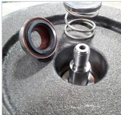
Black smooth face goes on motor shaft next