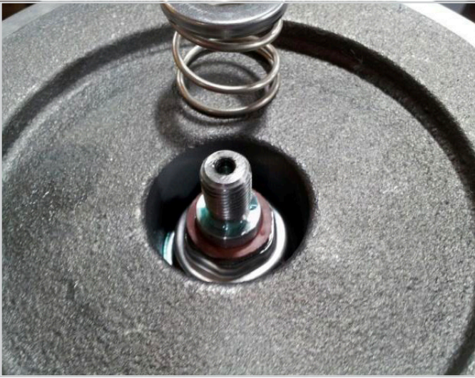
Press seal so 1/8" below the threads