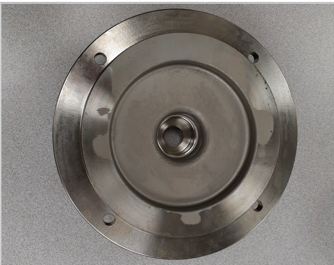
Stainless Pump housing 082-6323