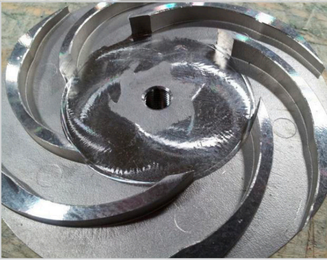
Open-Modified face #082-6312, (AF-ES, 5AGES)