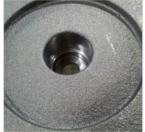
Use liquid soap to lubricate seal bore