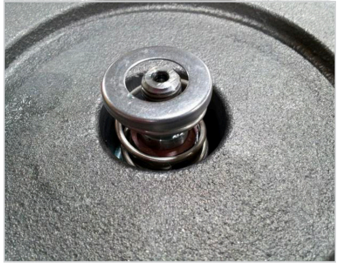
Place spring on w/spring cap toward impeller