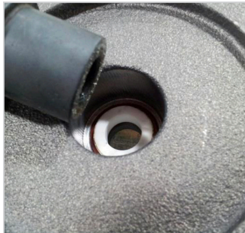
Installing tool #099-6007 to press to bottom of bore