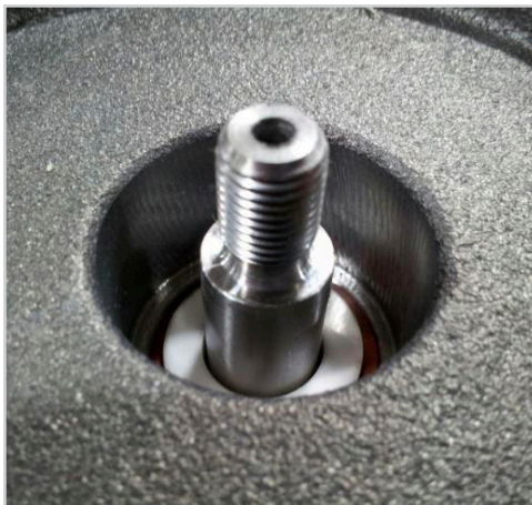
Install motor to housing, caution of ceramic