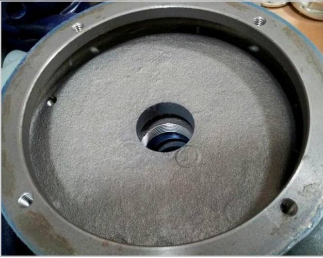
Standard, cork gasket, pump cover #082-6302 for closed impeller