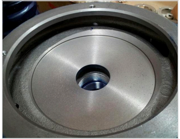
O-Ring gasket pump cover #082-6307 for open impellers