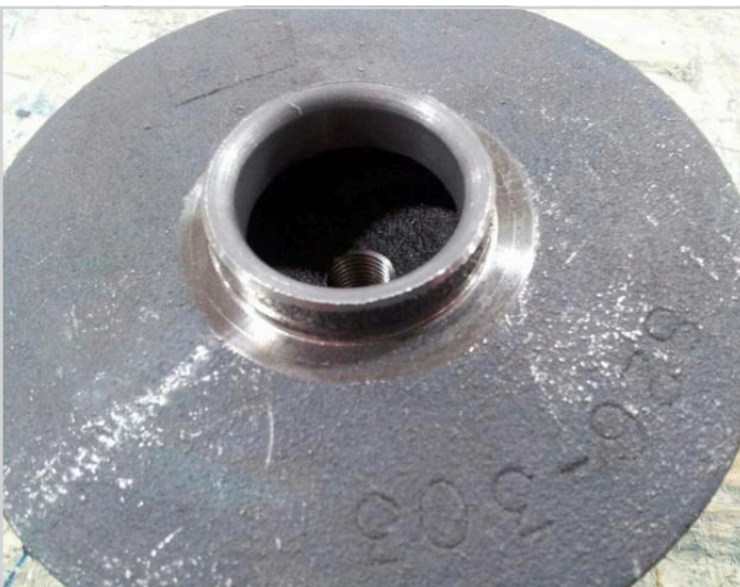
Standard closed face #082-6303 (AF-3D-S, ET-AF, 5AG-S)