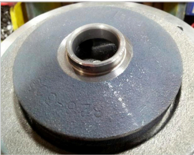
Screw on impeller by hand, RH threads