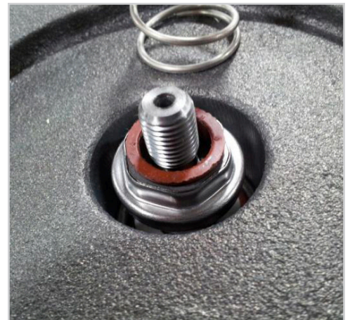
Press black portion of seal w/ installing tool