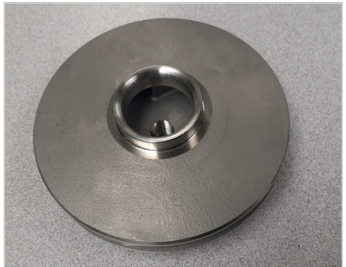
Stainless Pump impeller 082-6326