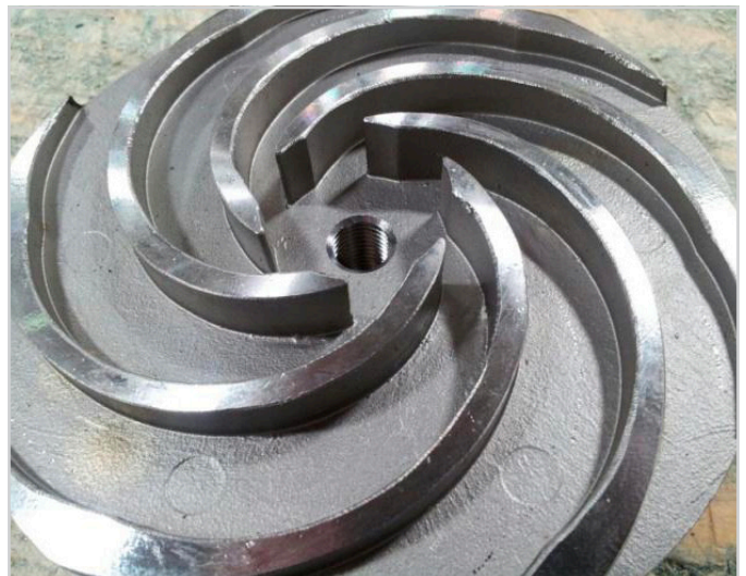
Open face #082-6306, (L3DW-S)