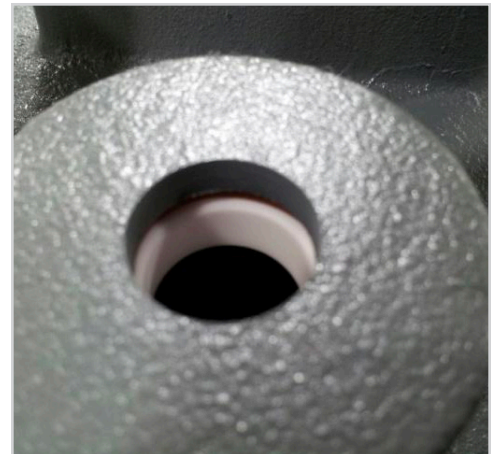
Inspect back side, seal sits flush to metal