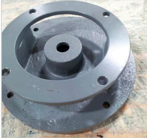
Showing the pump housing #082-6301, motor side