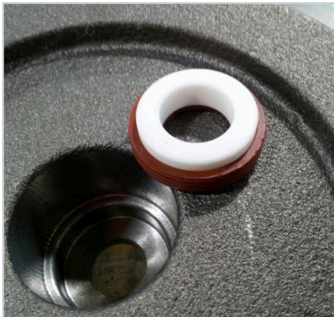
Ceramic, install with rubber boot on bottom