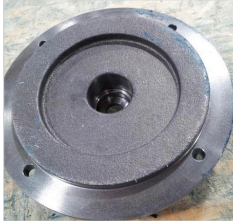
Pump housing, pump side