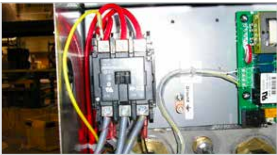
Booster control box showing booster contactor.

the socket, the circuit can be tested by pressing down the orange button on top of the relay. This will manually disconnect the tank sustainer heater control circuit, turning off the dishmachine tank heater. This is the test for correct circuit disconnection. This button is not a reset, but just a manual override.