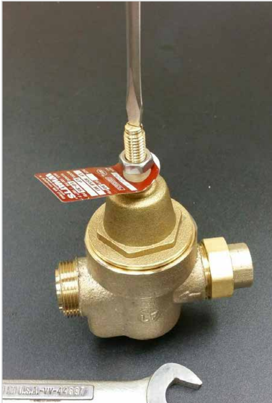
After loosening the lock nut, turn the center rod out (left) to reduce pressure.

The valve can only reduce pressure; it cannot make more or increase existing pressure from the building. By turning the adjusting rod on top of the valve out (turning to the left) pressure is reduced down. If the center rod is moved up or down and has no effect on the final rinse pressure, it is defective or clogged and should be replaced. Although rebuilding kits are offered, historically, successful rebuilding has been limited.