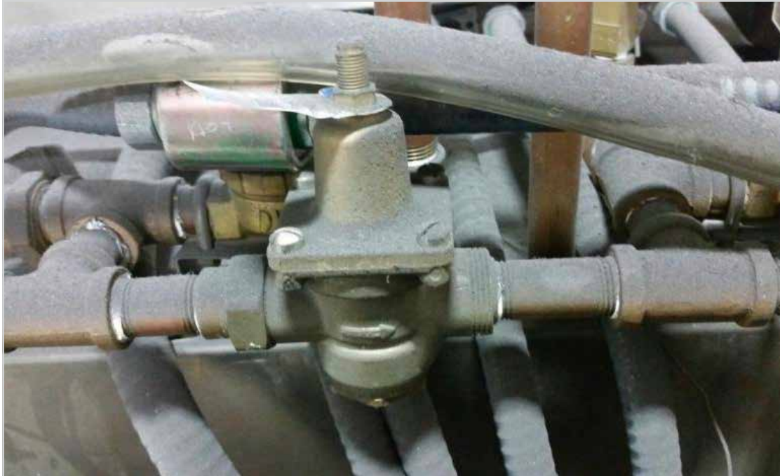
The union is seen at the right of the valve and has right hand threads with an o-ring seal

Before working on the plumbing, turn off the inlet water ball valve, operate the machine fill to relieve pressure in the manifold, and then open the line carefully. The valve has a female \frac{1}{2} " pipe thread union on the inlet side and female \frac{1}{2} " pipe threads on the outlet. Because the PRV is used with municipal water pressures and booster temperature it is hard plumbed for safety reasons. To remove, unscrew the union joint, it has an o-ring seal. Move the valve by tilting upward and twist off by turning left or counter-clock wise. Re install new valve in the same manner.