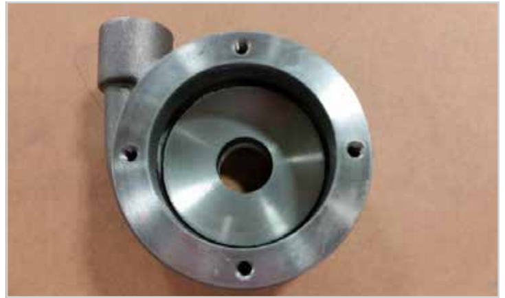
Open impeller (282-6308) 5 vane, 4.0" dia., low profile, screws on – right hand thread w/secure bolt (098-1443) washer (098-2413) Pump cover (282-6306), Rear housing (282-6307), Shaft Seal (292-2002), Fiber gasket (289-6609) Used on: ADC-44/66 for 1/3hp rinse pump w/motor 291-1003