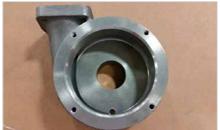
Open impeller (282-6303) 5 vane, 5.0" dia., deep profile, keyed shaft – w/ secure bolt w/lock strip (098-1613) washer (098-2711) Pump cover (282-6302), Rear housing (282-6301), Shaft Seal (292-2001), O-ring gasket (289-6603) Used on: ADC-44/66, HT25/34 for 3hp wash pump w/motor 291-1002