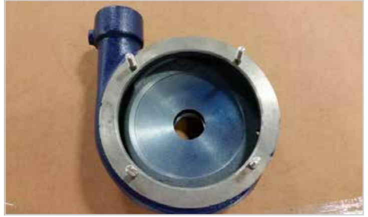
Open impeller (082-6312) 6 vanes modified, 5.0" dia., screws on – right hand thread Pump cover–stud mounted (082-6307), Rear housing (082-6301), Shaft Seal (092-2001), O-ring gasket (089-6309) Used on: AF-ES & AFC-ES 1.5hp pump w/motor 091-1001 and 5AGES 1.0hp pump w/motor 091-1024