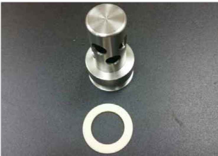
ASQ Spray Arm Pivot #084-6210 and Bushing Washer #098-2920