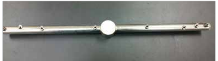
Spray Arm for 5AG, #081-6205 at 20" long (8 jets)