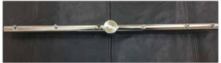
Spray Arm for AFES, AFCES #081-6216 ("E" stamped on hub) at 22.5" long (6 ES jets)