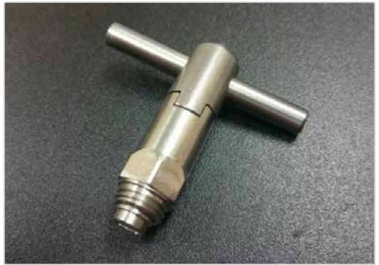
Spray Base Bayonet #099-1028