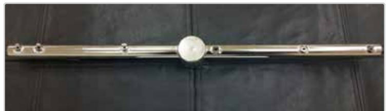
Spray Arm for 5AG-ES, WS2 or 5CD, AWS/AWS-H #081-6218 ("E" stamped on hub) at 20" long (6 ES jets)