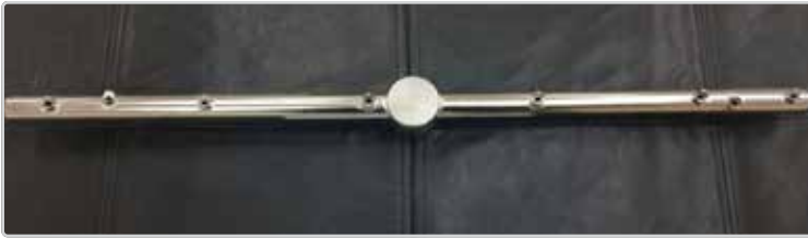
Spray Arm for ET-AF, #081-6208 at 20.25" long (12 jets)