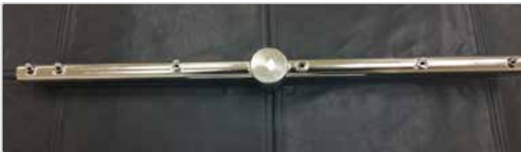
Spray Arm for 5AG-S, #081-6214 at 20" long (6 jets)