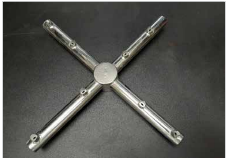
Spray Arm for ASQ, #081-6215 (cross arm) at 11.5" long (8 jets)