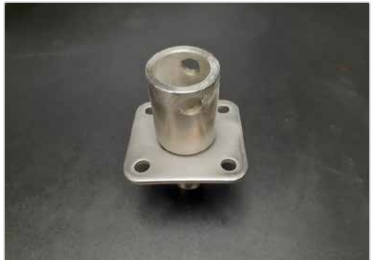
ASQ II Spray Arm Base #085-6645 for Spray Arm Bearing #081-6206