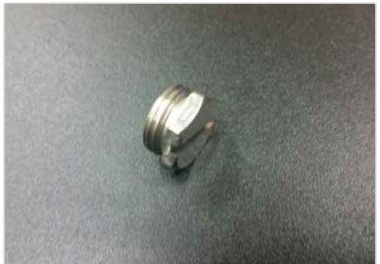
End cap #084-6211 thread size is 11/16-16 threads per inch, 11/16" wench, right-hand thread