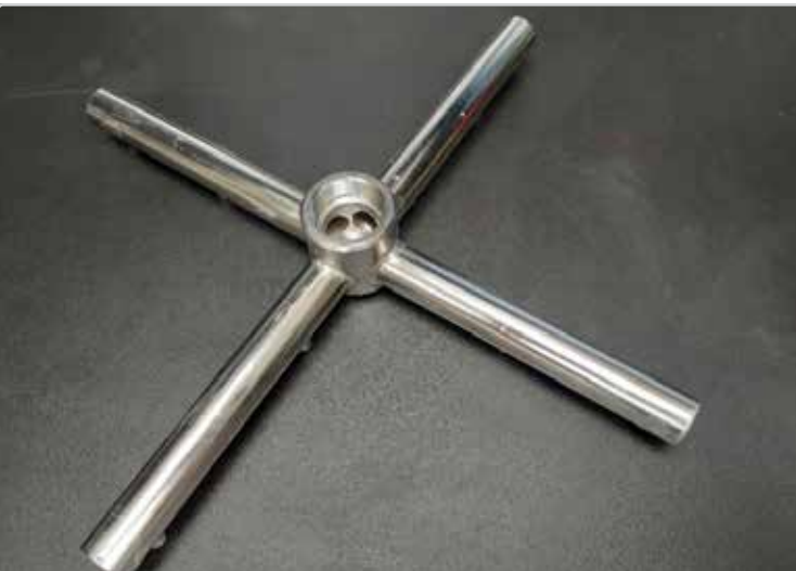
Spray Arm for ASQ II, #085-6662 (cross arm) 11.5" long (8 jets)