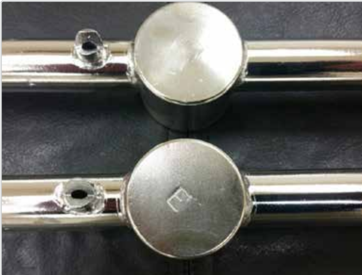
"E" stamp on Energy Star Spray Arm Hub