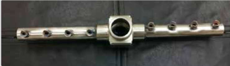
Spray Arm for ASQ, #082-6203 at 11.5" long (8 jets)