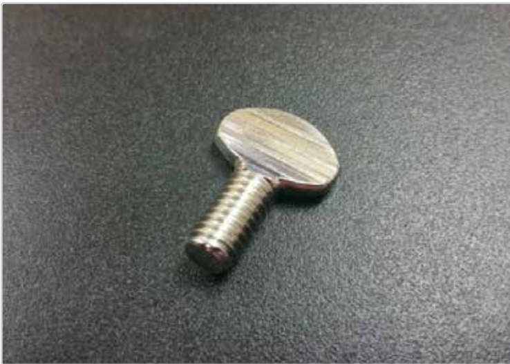
Spray Base Thumbscrew #098-1583