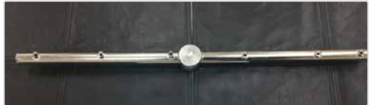
Spray Arm for AF-3DS, AFC-3DS, L903DWS, #081-6211 at 22.5" long (6 jets)