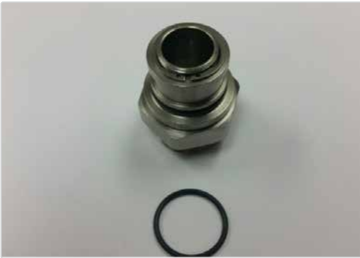
Spray Arm Bearing #081-6217 (cleanable), takes a 1.25" wrench, right-hand thread, with "O" ring #089-6310 (.019)