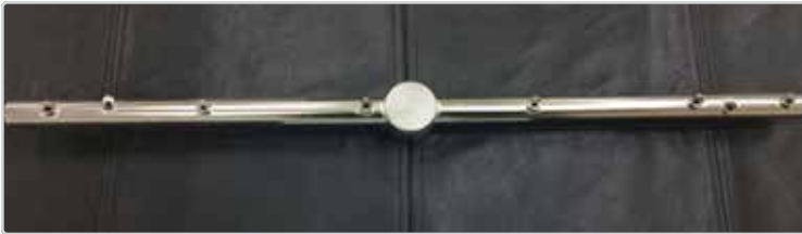
Spray Arm for AF, AFC, AFB, #081-6204 at 22.5" long (8 jets)