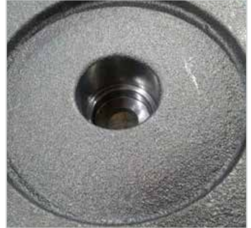
Use liquid soap to lubricate seal bore