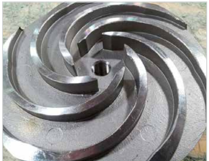
Open face #082-6306, (L3DW-S)