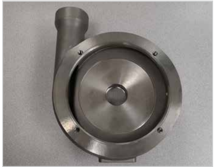
Stainless Pump cover 082-6324