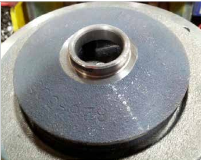
Screw on impeller by hand, RH threads