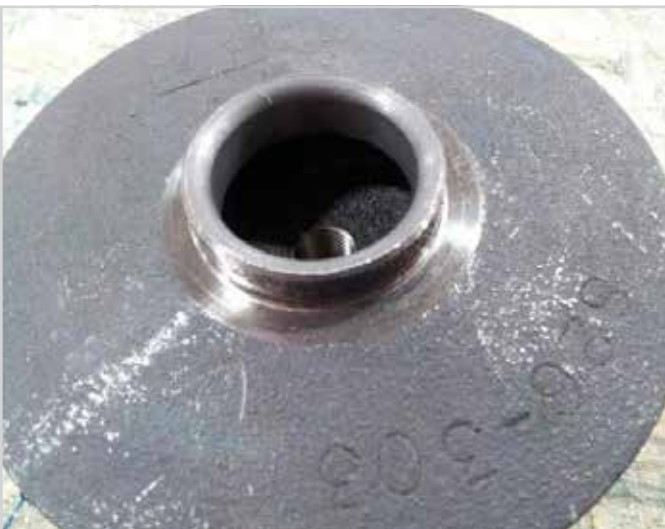
Standard closed face #082-6303(AF-3D-S, ET-AF, 5AG-S)