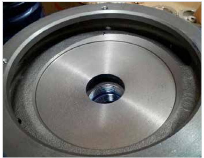
O-Ring gasket pump cover #082-6307 for open impellers