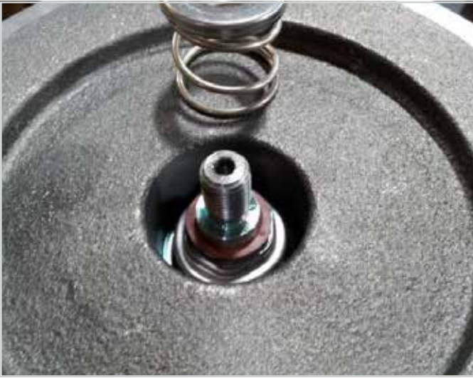
Press seal so 1/8" below the threads