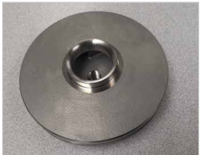
Stainless Pump impeller 082-6326