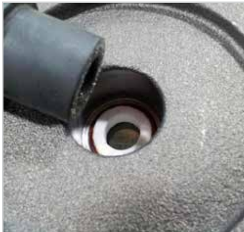
Installing tool #099-6007 to press to bottom of bore