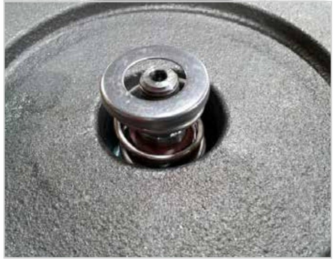
Place spring on w/spring cap toward impeller