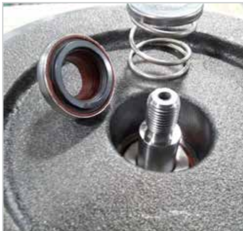
Black smooth face goes on motor shaft next