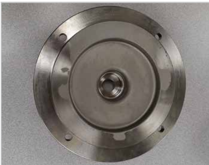
Stainless Pump housing 082-6323