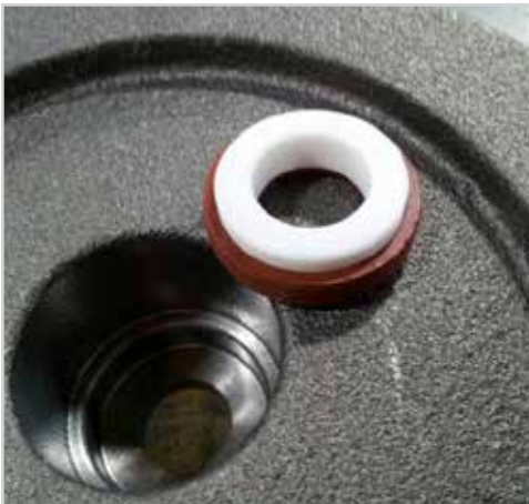
Ceramic, install with rubber boot on bottom