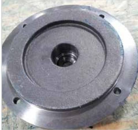
Pump housing, pump side