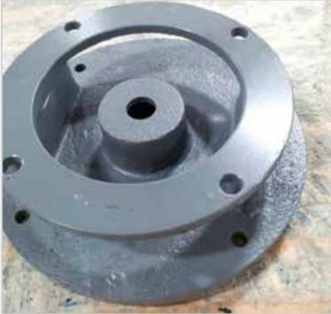
Showing the pump housing #082-6301, motor side