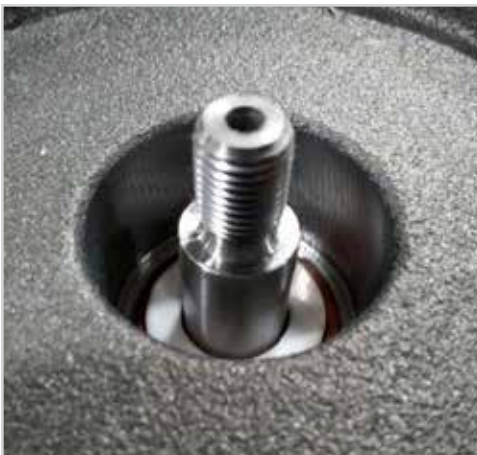
Install motor to housing, caution of ceramic