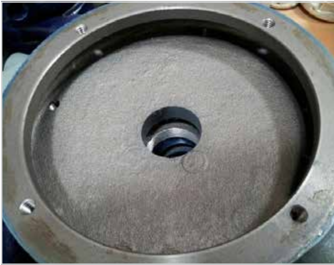
Standard, cork gasket, pump cover #082-6302 for closed impeller