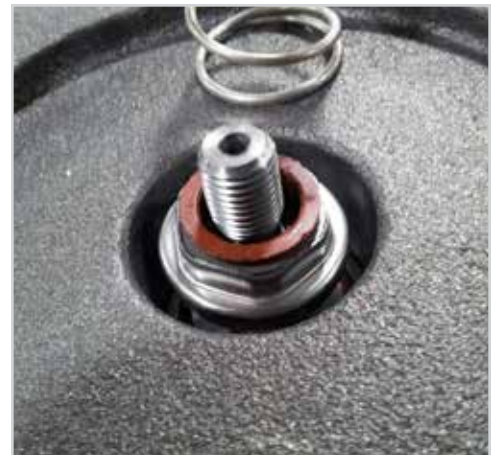
Press black portion of seal w/ installing tool