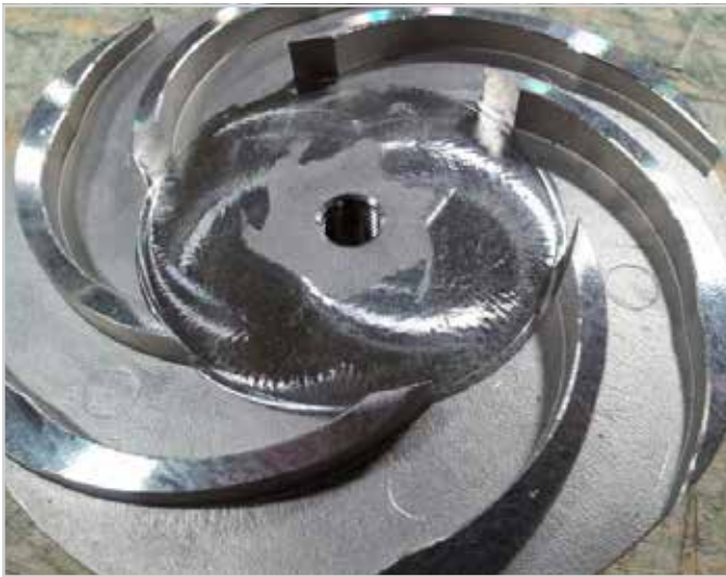
Open-Modified face #082-6312, (AF-ES, 5AGES)