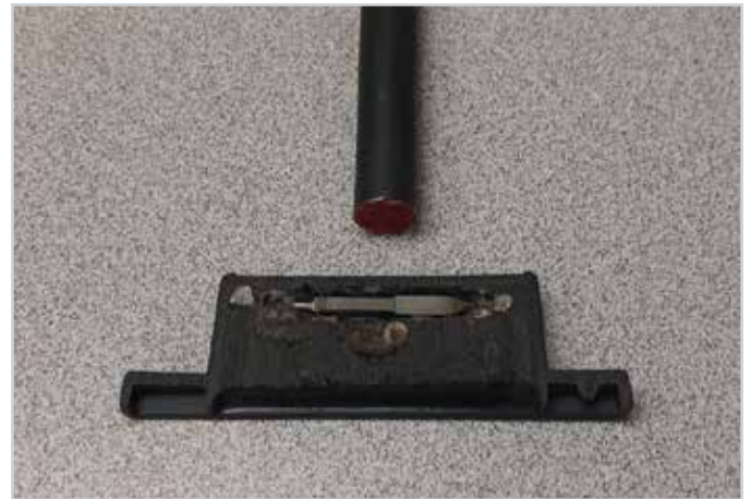
ADS reed WITHOUT printed circuit board

To avoid this motor hazard, the design of the ADS motor control uses a single reed switch with no internal switching board. The ADS reed sends the signal for the motors by activating a double-pole relay (291-3005), which then carries the greater current to motor contactors. The ADS reed is N/C, it is always closed. This means its motor is normally on, the motors will be running if the machine is turned on. The only way to turn the motor off then is if a strong magnet (N52 or lift 10 lbs) is within .50" radius sensing range of the reed. With proper alignment, every time the magnet swings back to its "rest" position, it is over the reed and pulls the switch off. This motor control design is not affected by electrical noise or voltage spikes.