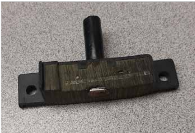
A typical reed WITH printed circuit board

The ADS reed switch (291-3011) is different than other manufacturer's reed switches. It has no printed circuit electronics contained in the body of the switch. The reed alone is only capable of switching current measured in watts rather than amps. This is the reason other reed switches employ a small circuit board to do the actual amperage switching. However, a circuit board is subject inadvertent motor starting caused by typical spikes and electrical noise found in commercial kitchens. This motor starting could cause injury to operators.