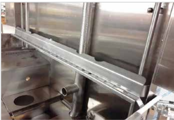
Adjustments for tightness should only be done on the rear tray track

Wash magnet 2.5" from the front edge, 6.5" from soil side. Rinse magnet 2.5" from the front edge, 3.375" from clean side.