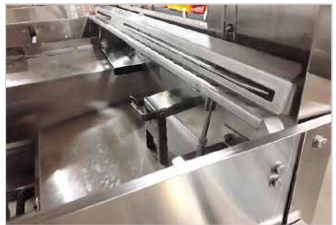
A broken or leaning front tray track will push the magnet pendulums out into the tank, this will cause the motors to keep running after a rack exits the machine. See above

Marking the original position is highly recommended for the holders of the reed switches also, it will save a great deal of time in the replacement and alignment of the new control parts.