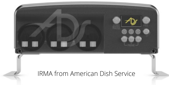
IRMA from American Dish Service

Revolutionizing Service, Maintenance, and Control in Commercial Dish Washing